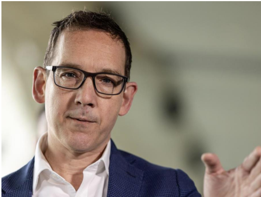
Victorian Minister for Outdoor Recreation Steve Dimopoulos.

But Mr Dimopoulos ruled that the callers should stay.